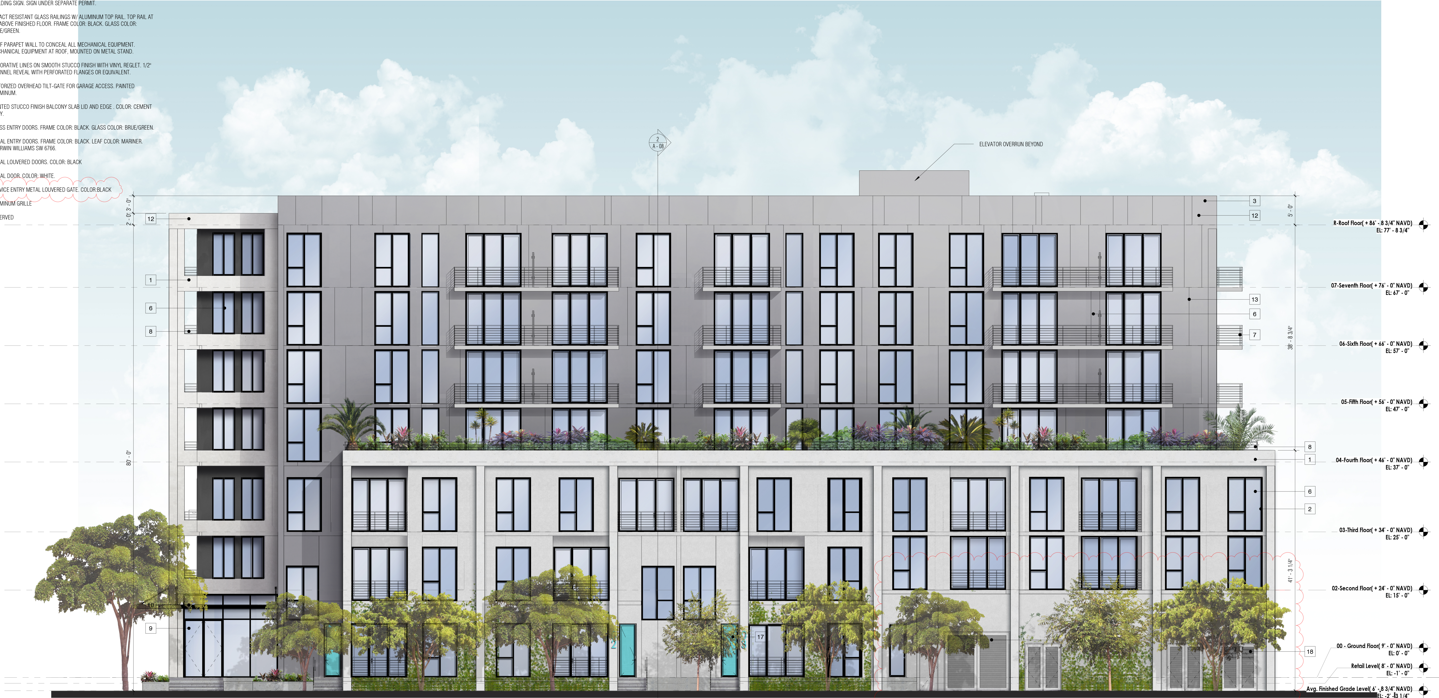
1 05 OVERALL EAST ELEVATION A - 12 Scale: 1/8" = 1'-0"